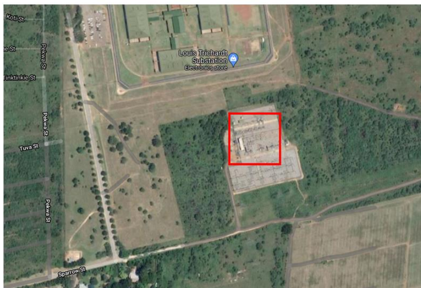
Table 1 : Location of Site